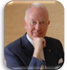
Tony Buzan Founder of Mind Maps®

The call for a faster, better and cheaper economy is a matter of survival. In the face of growing competition, local workers need to do more with the same resources such as time, effort and money. Using Buzan Brain Smart techniques you can! Over the past 30 years, Tony Buzan has been at the forefront helping people and companies do more with less, become more intelligent, efficient and productive. Come upsize your capabilities and be equipped with the Buzan Productivity Skills in this new programme.